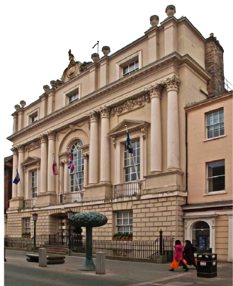
The Mansion House